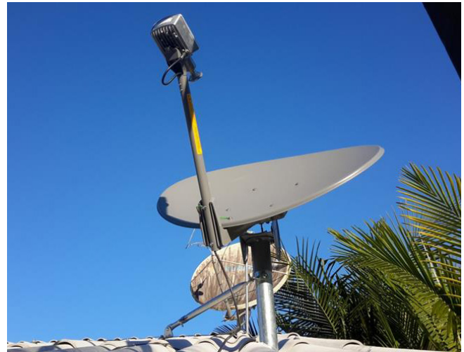
Hughes JUPITER VSAT Remote

Mobile phone penetration in urban centers in Latin American countries is nearing one hundred percent, but there is a lot of potential for growth with respect to providing coverage to rural and hard-to-serve areas and providing a quality mobile broadband user experience to all subscribers regardless of location. According to a market forecast by Euroconsult most of the mobile growth in the Latin American region will be coming from 3G and LTE coverage extension and expansion.