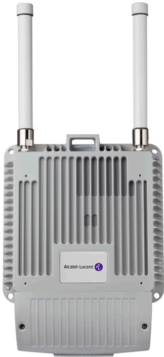
Pole mounted Small Cell (ALU 9363 Metrocell)

Among its many capabilities, the JUPITER System gateways are designed for “lights-out” operation and can be fully managed from MNLA’s Network Operations Center (NOC) in Lima, Peru. No personnel are required for daily operations at the gateway sites in Laredo, Texas and Arica, Chile. These locations are ideally located to provide coverage for the required regions and they experience the least amount of bad weather that could interrupt service.